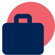
Generous annual leave entitlement