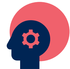
Mental health first aiders