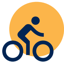
Cycle to work scheme