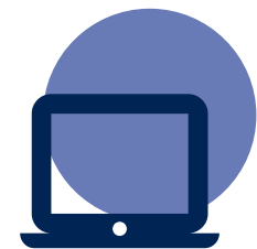
Money off tech