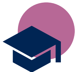
Personal learning and development