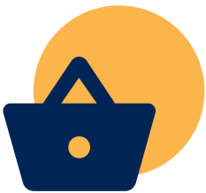
Perkbox: money off goods