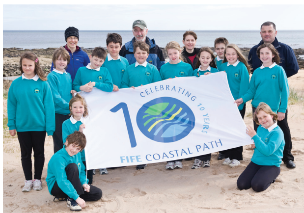
Flag raising at Kingsbarns Beach

The new financial year saw us reach a huge milestone with the tenth anniversary of the opening of the Fife Coastal Path from the Forth Bridge to the Tay Bridge.