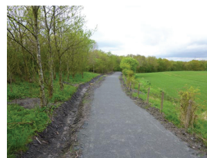
Lochgelly to Dundonald before and after

Our maintenance team also spent time improving 500 metres of the Fife Coastal Path at Seafield Tower, Kirkcaldy and then created a new path at Ravenscraig Park.