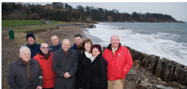
Councillors and FCCT at Pathhead Sands

It was announced that we had been awarded £275,000 from the Coastal Communities Fund, which is managed by the Big Lottery Fund on behalf of the UK Government. The funding will be used over the next two years to undertake a number of projects aimed at creating and sustaining jobs along the Fife Coast. Works will include the creation of circular walking routes at Newburgh and Birkhill in the north of Fife, the installation of predictive water quality signage at the East Sands in St Andrews, the replacement of lifesaving equipment at designated bathing beaches across Fife and the revitalisation of Kirkcaldy's Pathhead Sands, where work will be carried out on the beach, the dunes, and the natural habitats along with other works aimed at upgrading the beach to the standard of other recreational beaches in the area.