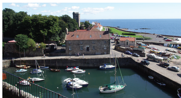
The Harbourmaster's House

The autumn season started off with the great news that Fife had been ranked as the number one destination for outdoor recreation for the seventh year in a row. Scottish Natural Heritage undertake the "Scottish Recreation Survey" every year. The report stated that the Kingdom's great outdoors received nearly 33 million visits which is approximately 100 times the actual population of Fife! We are fortunate that Fife boasts a variety of extraordinary coastal and countryside sites and it is hugely rewarding to know that our hard work along the Coastal Path, at beaches, nature reserves and other sites is helping to give people the chance to experience Fife's outdoors.