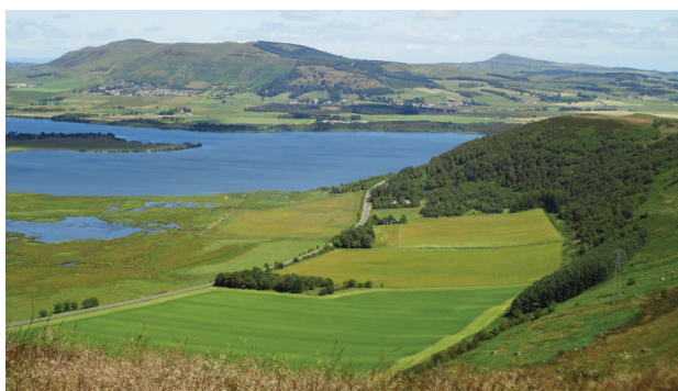
Views across to the LLLP area

For the last three years, we have led a partnership of local organisations to develop and apply for funding from the Heritage Lottery Fund's Landscape Partnership Programme. The Living Lomonds Landscape Partnership project formally submitted its application in March 2013 and, in August 2013, we received the fantastic news that the Partnership had been awarded £1.7million in funding from the Heritage Lottery Fund to deliver the project across the Lomond and Benarty Hills, aiming to reconnect people with the landscape. There are over 40 exciting projects planned across the project area. Work started almost immediately and focused initially on recruitment of staff. Work on the ground commenced in January