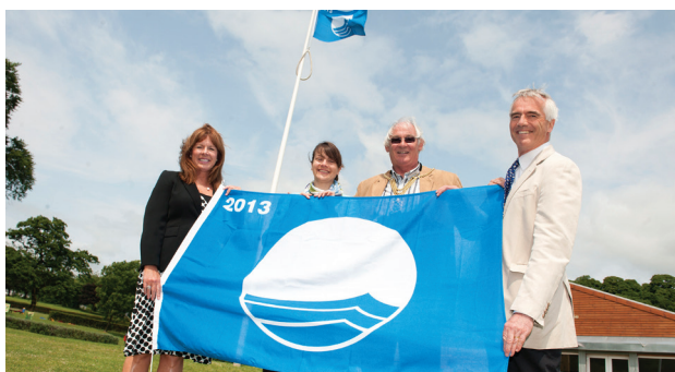
Celebrating another successful Blue Flag year

The summer arrived and what a glorious summer it turned out to be! Record numbers of people were at our beaches and on the Coastal Path. Whilst this was wonderful to see, it did bring with it challenges!