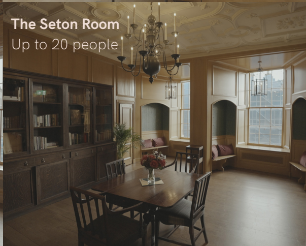
The Seton Room