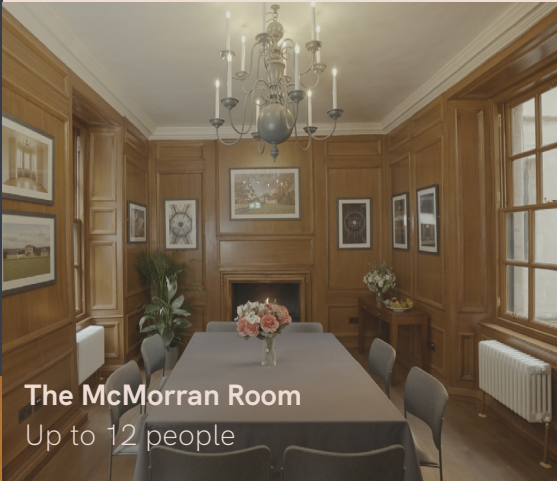
The McMorran Room