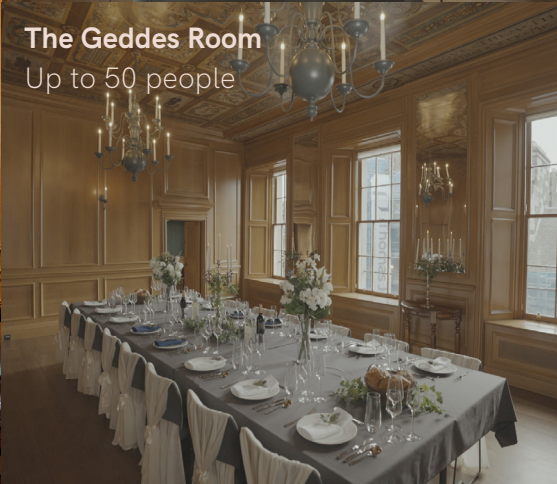
The Geddes Room